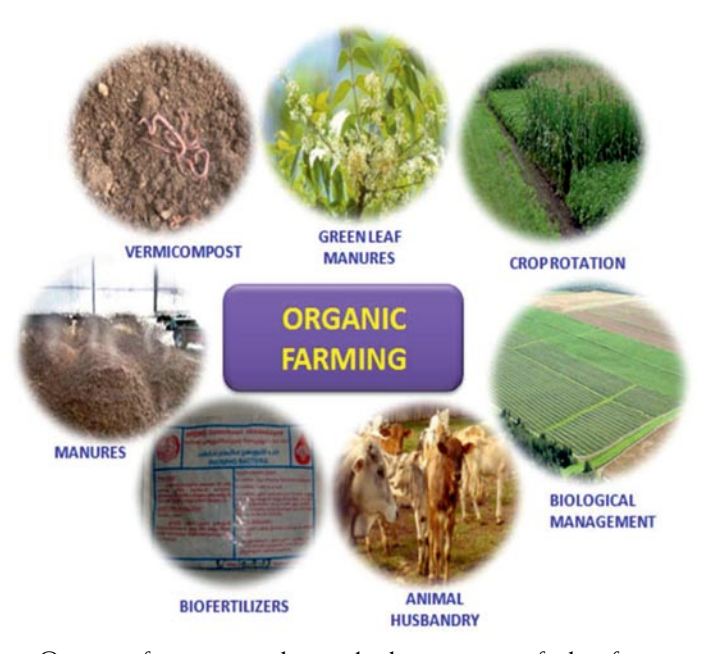
Organic farming, without doubt, is one of the fastest growing sectors of agriculture production in NER.

crop rotation is important for soil fertility management, weed, insect and disease control; maintenance and enhancement of soil fertility through biological nitrogen fixation: Symbiotic and Asymbiotic N-fixation; addition of bulky and concentrated organic manures; use of soil micro-organisms, crop residues, biogas slurry, waste, green manuring azolla, biochar, organic formulations like Panchagavya, an organic product with the potential to play the role of promoting growth and providing immunity in plant system, made up of nine products viz. cow dung, cow urine, milk, curd, jaggery, ghee, banana, tender coconut and water, etc. Vermicompost and vermiwash have become major components in biological farming, which are found to be effective in enhancing the soil fertility and producing large numbers of horticultural crops in a sustainable manner. Farmers can fetch premium prices for organic produce along with conserving local crops which are common for farmers in their localities as local crops are more resistance to biotic and abiotic stresses. The NER is home to many niche crops like large cardamom, ginger, turmeric, Assam lemon, Joha rice, medicinal rice, Naga chilly (Bhoot Jolkiya), areca nut and Passion fruit with high market demands.