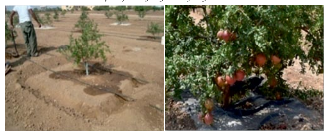
Techniques for laying out of inorganic mulch